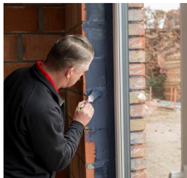
Figure 1: Soudatight LQ